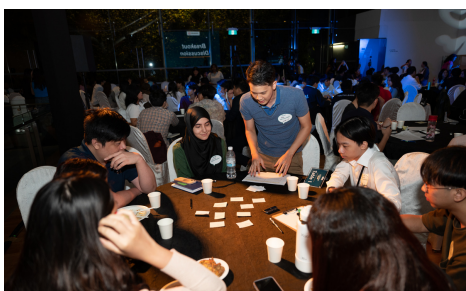
What issues are youths concerned about?